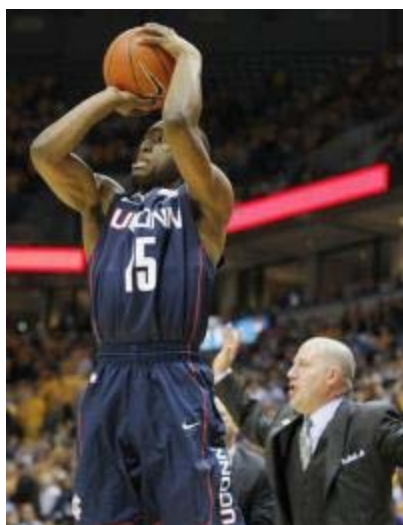
An NBA scout said Connecticut guard Kemba Walker is shooting the ball much better from the outside this year.

"I like the fact that he has gotten appreciably better each of his three seasons at UConn. His scoring has jumped from 8.9 his freshman season to 14.6 his sophomore season to 25 this season.